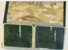
FLVL41 - Power Driver