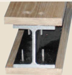
HDVL71 - Heavy Duty Driver